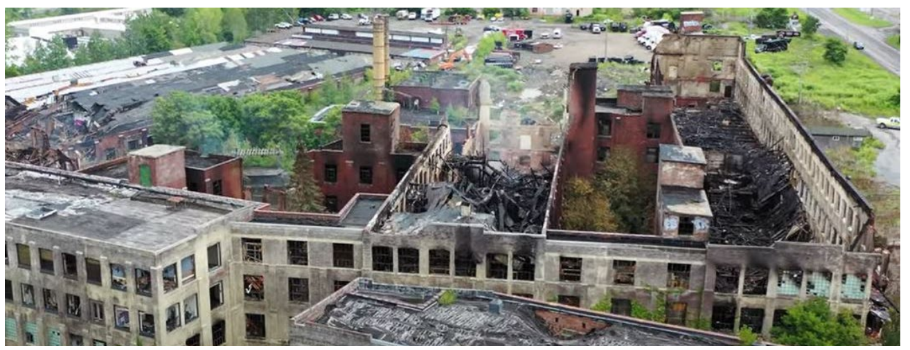
Before (August 2020): View of site structures after a fire in August 2020.

The New York State Department of Environmental Conservation (NYSDEC) referred the Charlestown Mall site to the U.S. Environmental Protection Agency (EPA) in 2008 after unpermitted demolition activities at several site buildings released asbestos, a hazardous substance, into the environment. EPA's Emergency Response program led two cleanups at the site, in 2010-2011 and 2020-2022, to protect people's health and the environment. EPA's activities have finished. This fact sheet serves as a resource for community members, prospective purchasers and local governments and provides information about site cleanups, the status of the site's property ownership, current site features, and potential for site reuse.