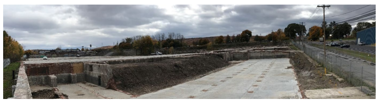
After (October 2022): View of site conditions, from the northwest corner of the site. Turner Street is visible to the right. Remaining concrete slabs are shown in the foreground. Bleecker Street is visible in the background.